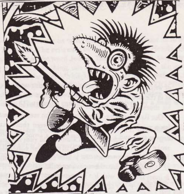
An Israeli settler after seeing too many "Holocaust" movies.