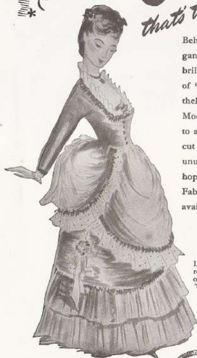
Lucy's dress in Act 2, reproduced from the original drawing by Tanya Moiseiwitsch.

Behind the footlights, the extravagance of a glorious past has been brilliantly evoked by the beauty of 'Celanese' Fabrics. Nevertheless these are essentially Modern Fabrics—they belong to a fashion-world where clean-cut lovely lines emphasize their unusual beauty of texture. We hope that before long 'Celanese' Fabrics will be more freely available in the shops.