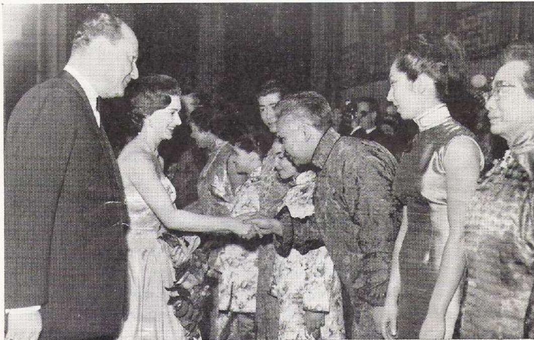
Princess Margaret met the cast of "Flower Drum Song" when she went back-stage at the Palace Theatre after attending the premiere. She was accompanied by the American director, Jerome Whyte.

Stalls : 30/-, 25/- Dress Circle : 30/-, 20/- Upper Circle : 15/-, 12/6 Balcony : 6/-