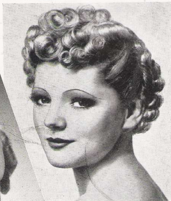
Here is the famous "HAIR BUBBLES" (short-cut-Perm) called by the elite "The Prepotent" for it scorns imitations and substitutes.

The House of VASCO Specialises in: Permanent Waving (all processes) on any length of hair. Designing individual styles; artistic cuts and sets; Tinting and Toning; Bleaching and Hair Work of all kinds. CLINIC for the treatment of HAIR and SCALP DISORDERS — Trichologist in attendance.