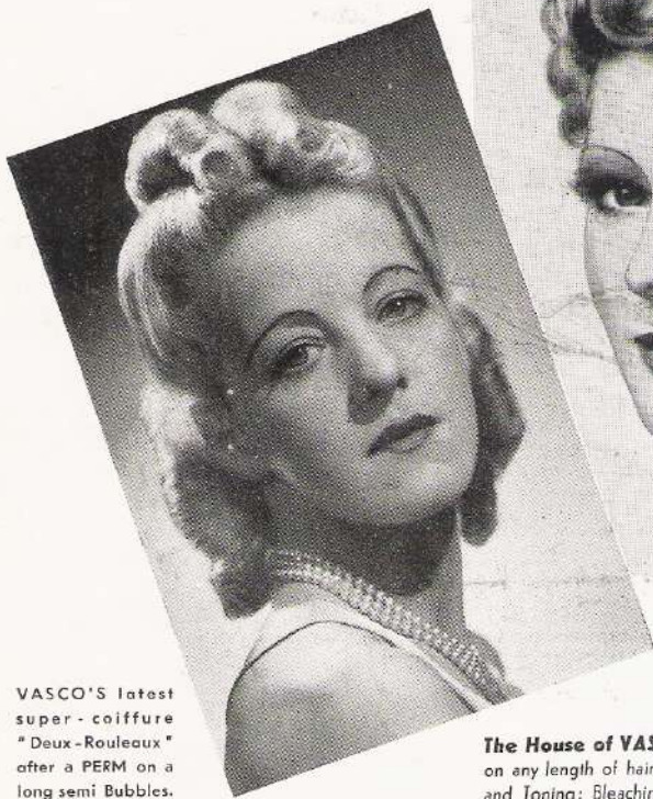
VASCO'S latest super-coiffure "Deux-Rouleaux" after a PERM on a long semi Bubbles.

World-centre for the perfected beautifying of Womankind, present to you, charming readers, their compliments and two of Monsieur VASCO'S Hair Creations.