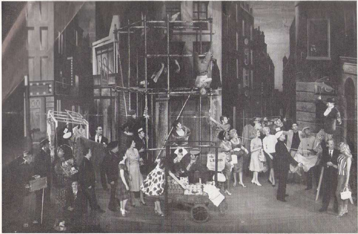
A SCENE FROM THE SHOW