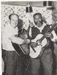
Mamma Mia Restaurant Watford