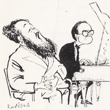
Reproduced by permission of "PUNCH"