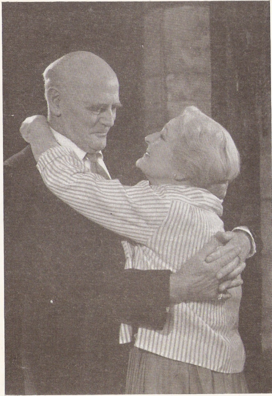
DAME SYBIL THORNDIKE and SIR LEWIS CASSON