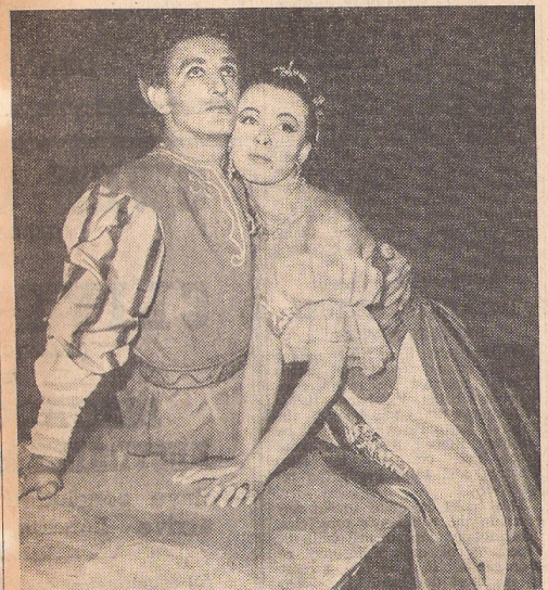
Alan Badel as Romeo and Claire Bloom as Juliet, in a scene from the first production of the new Old Vic season which begins on Monday next