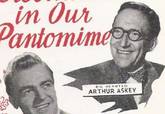
BIG HEARTED ARTHUR ASKEY