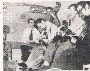
Coffee Bar THE VIPERS SKIFFLE GROUP