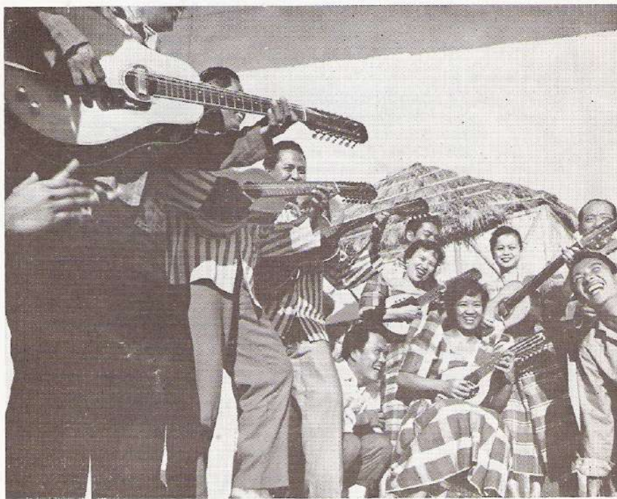
Shown here is the Rondalla, or native stringed band of the Bayanihan Philippine Dance Company. The instruments shown range from the tiny Octavina with a high voice to the Laud which provides the bass accompaniment. The scene shown is from the final portion of the Bayanihan programme called Rural Philippines Suite.