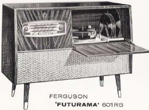
FERGUSON 'FUTURAMA' 601RG

As well as being an exceptionally fine performer, the new Ferguson 'Futurama' is also an attractive piece of furniture. It combines VHF/FM, Medium and Long wave band radio with a 4-speed autochanger and has 'Magic-eye' tuning and 'Piano-key' switching. Provision is included for easy adaptation for playing stereophonic records. Ask your Ferguson dealer for a demonstration. 66 GNS tax paid.