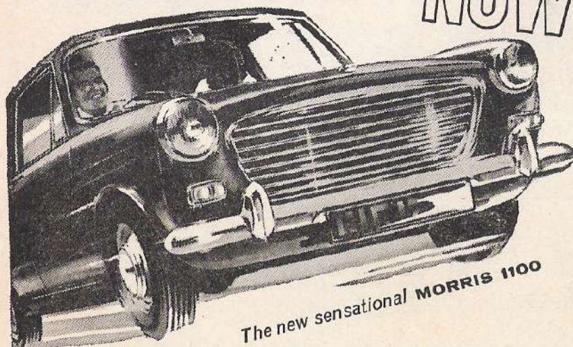
The new sensational MORRIS 1100