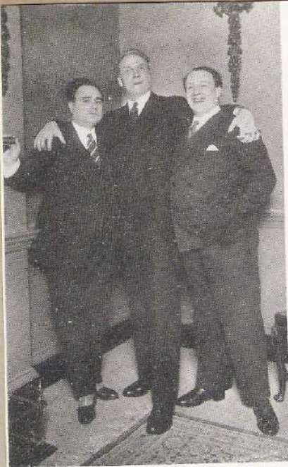
Three Great Singers — Gigli Chaliapin Tauber

Tutto il mio tributo d'affetto, S'amico e collega sinceramente Bruno Walter 1948