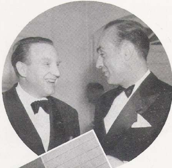
With Charles Boyer