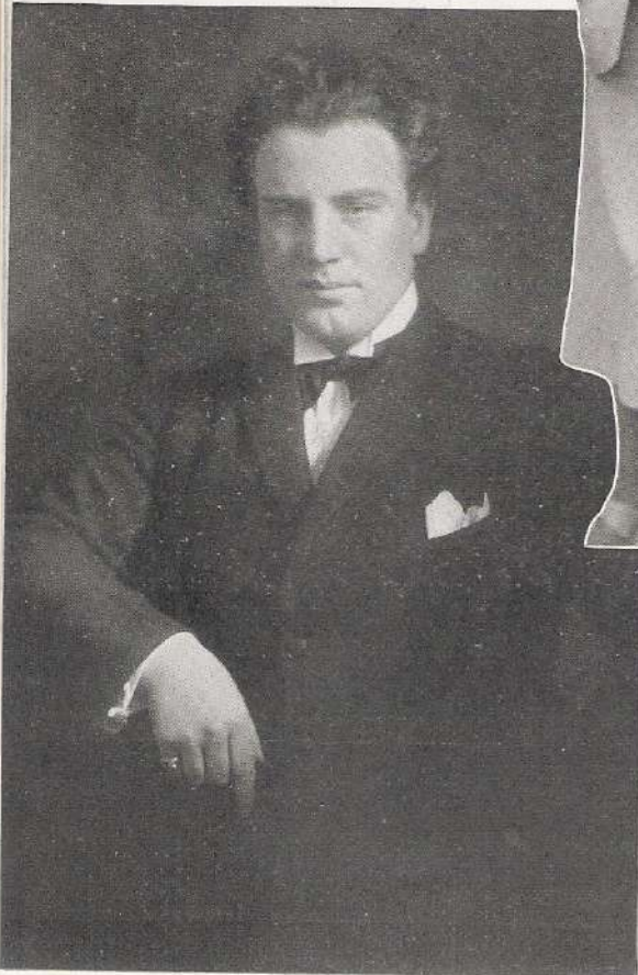
Dresden — 1928