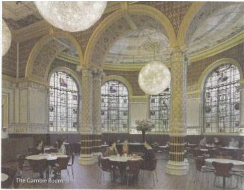
The Gambie Room

The V&A's collections are unrivalled in their diversity. Explore historical and contemporary art and design, including works of art from many of the world's richest cultures: