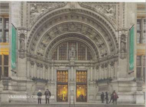
V&A entrance, Cromwell Road

Victoria and Albert Museum Cromwell Road London SW7 2RL 020 7942 2000 www.vam.ac.uk