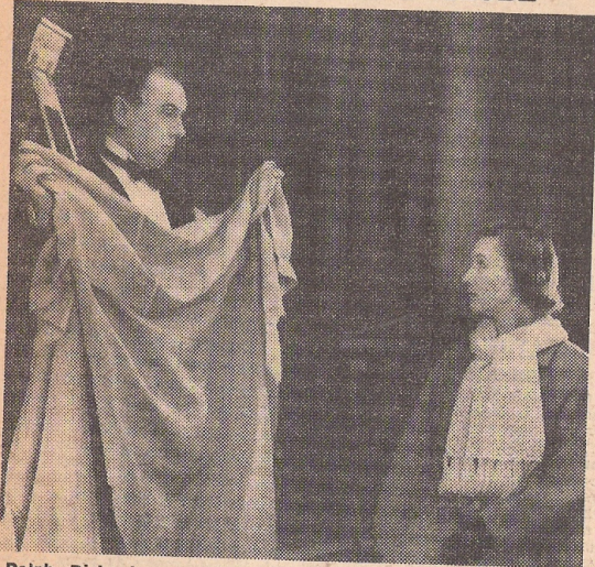
Ralph Richardson and Meriel Forbes in R. C. Sherriff's new comedy, "The White Carnation," which ingeniously introduces a ghostly stockbroker into the blitzed remains of his former home