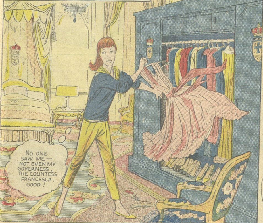
AS SOON AS THE WAY WAS CLEAR, PRINCESS LOLA STOLE UPSTAIRS TO HER PRIVATE SUITE

NO ONE SAW ME — NOT EVEN MY GOVERNESS, THE COUNTESS FRANCESCA. GOOD!