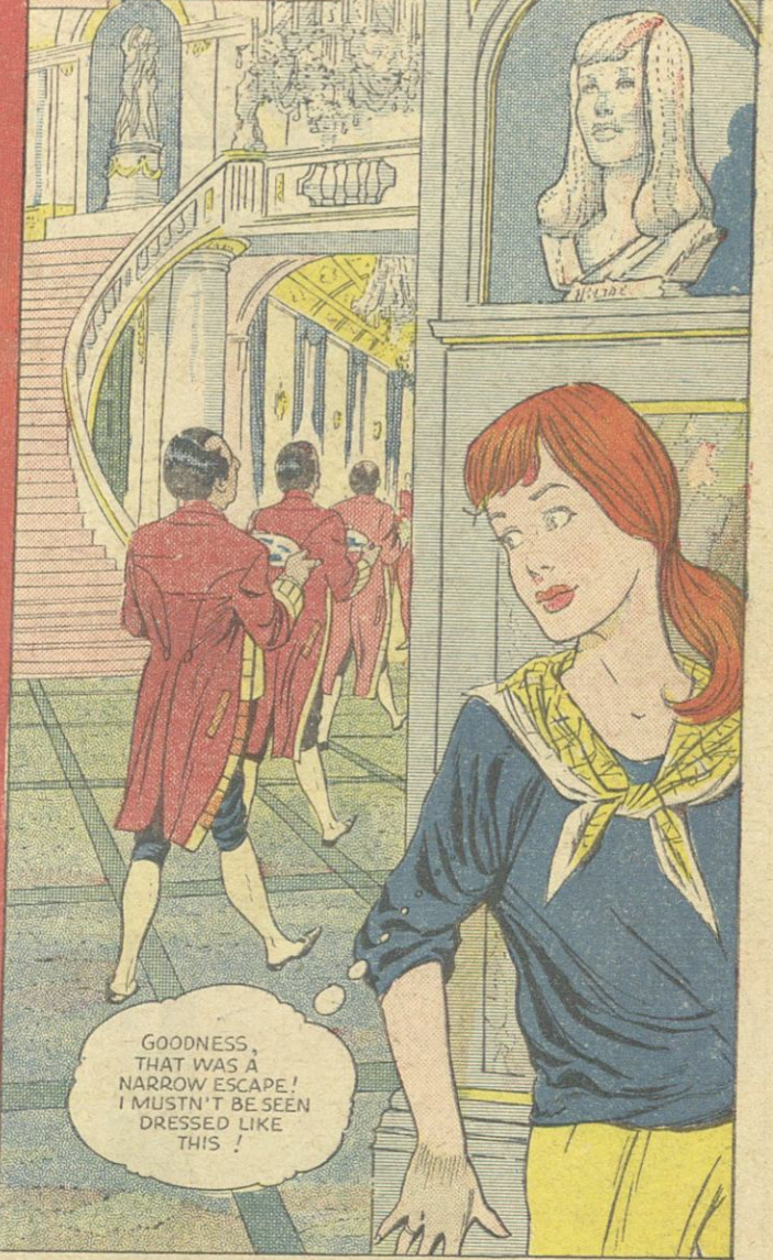
IN THE GREAT HALL OF SAN SERENO CASTLE, THE PRINCESS STOOD MOTIONLESS AS FOOTSTEPS PASSED CLOSE BY

GOODNESS, THAT WAS A NARROW ESCAPE! I MUSTN'T BE SEEN DRESSED LIKE THIS!