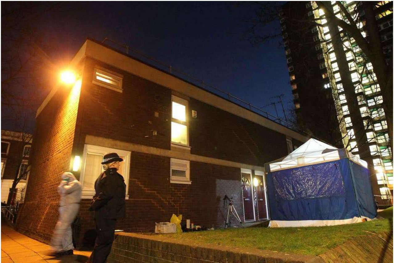
Police investigation: forensic officers at the scene