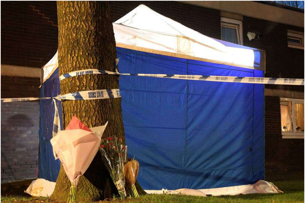
Murder investigation: flowers left at the scene in Westbourne Park Road, Paddington

Neighbours today said his mother had looked “worried” in the days leading up to the deaths and the couple had spoken of plans to return to their native Morocco.