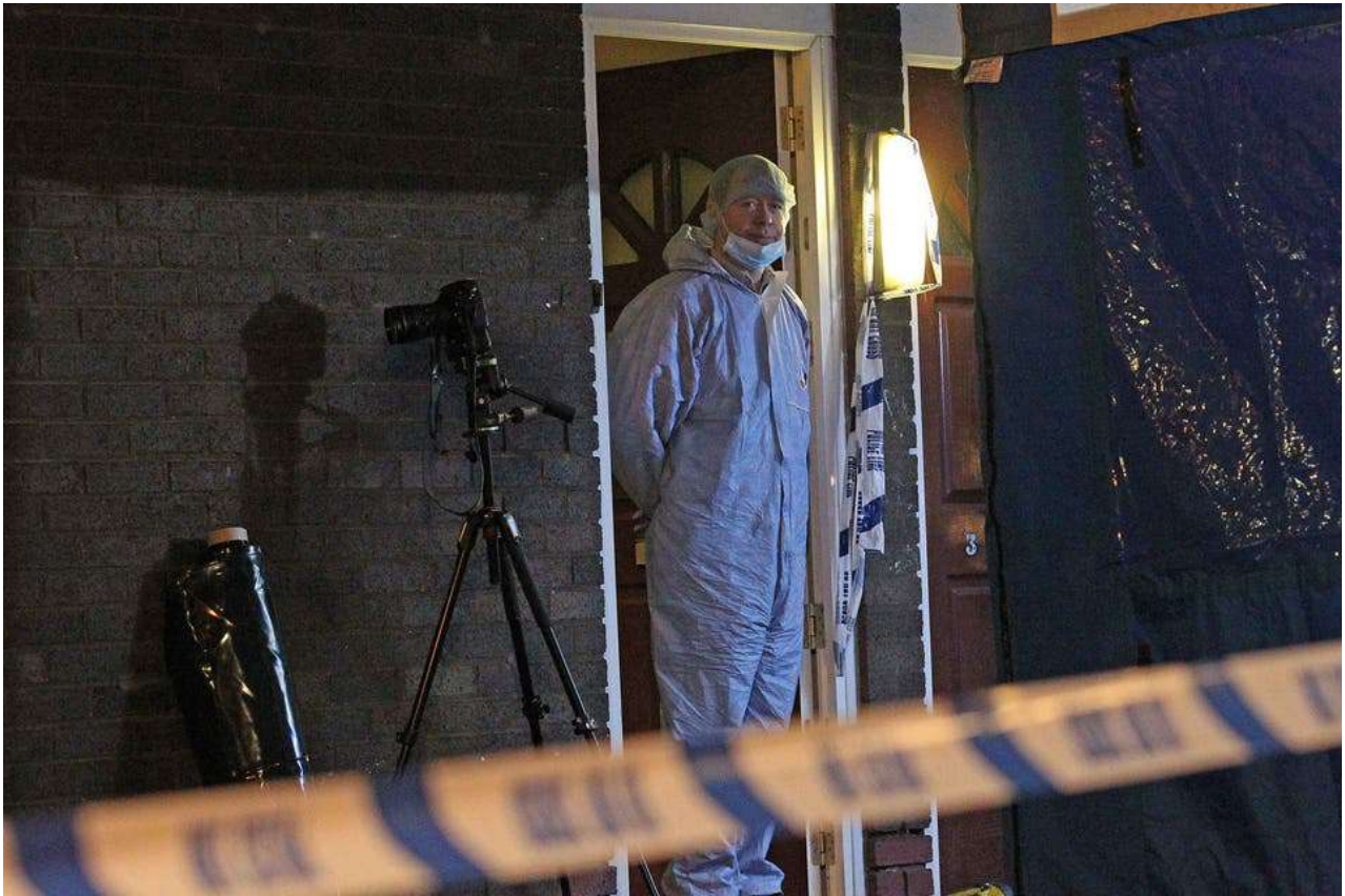
Police tape: a forensic Officer at the flat entrance