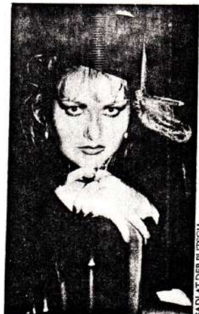
SADI AT DER PUTSCH