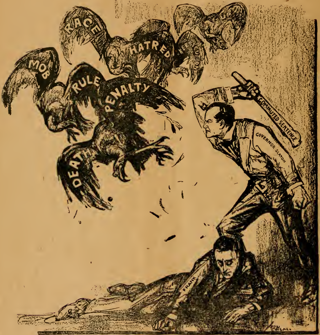
GOVERNOR SLATON BEATING OFF THE VULTURES.—From Straus' Puck .

Blackstone expressly says that it would be against all correct principles, to allow the power of judging and of