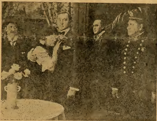
FRANK'S WIFE'S DEVOTION AT THE TIME OF HIS ARREST, AS SEEN IN THE HEARST-SELIG "MOVIES."

Four of the six Justices held that the trial of Frank had been perfectly fair, and that he had been properly