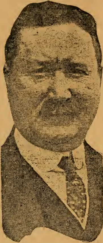
THE NOBLE BURNS.

"I am prepared to prove that the lock of hair was placed on the handle of a lathe by a newspaper reporter for the sake of a sensational 'scoop.'"