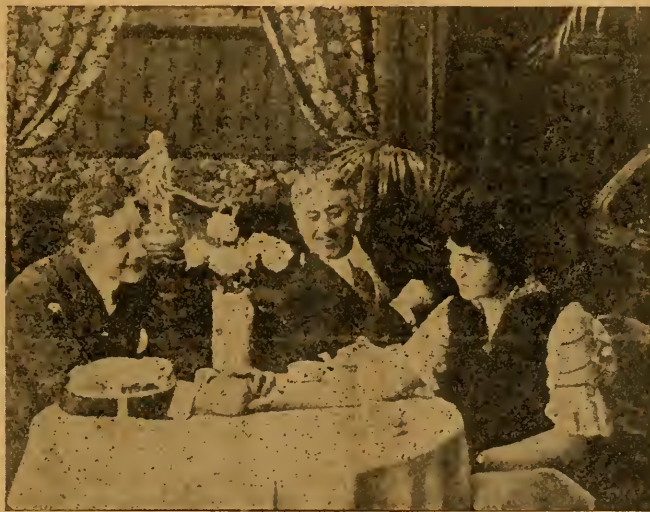
FRANK'S HOME LIFE IDEALIZED IN THE HEARST-SELIG "MOVIES."