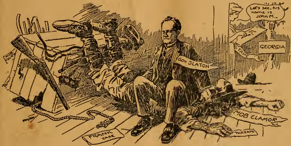
JEW CARTOON—SLATON SUPPRESSING "MOB LAW."

But Slaton felt no pity; he devoted no anxious days and nights to the study of that case : he made no mysterious visits to New York while that case was pending: and he had nothing to say against circumstantial evidence, then .