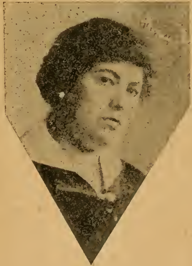
LEO FRANK'S WIFE.