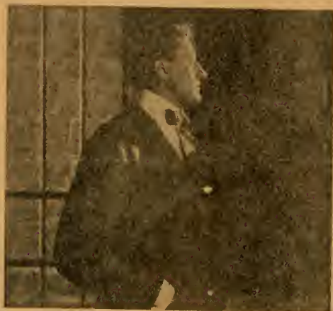
LEO FRANK. IDEALIZED IN THE HEARST-SELIG MOVING PICTURES.

close to the man whose active brain dictated those notes.