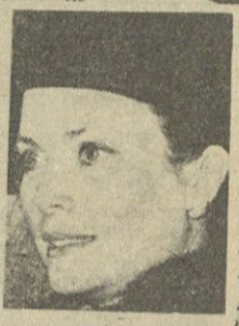
BLAMED: Princess Grace of Monaco.

Asked why people are frightened by the very mention of his band's name Rotten replied: "Because they are pathetic wimps. It's called honesty and it always frightens people — always."