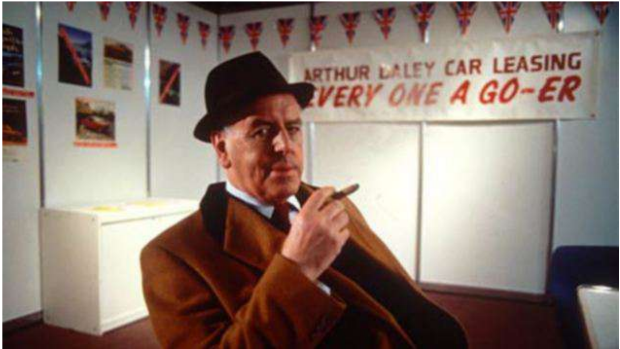
George played a wheeler-dealer, Arthur Daley, for 15 years in TV series Minder

Trinians , while Sim, in drag, played the headmistress. Cole's persona fitted the spiv character to a tee, the loveable rogue, but it was not really a lead role, in fact though he was never out of work, Cole and leads did not go together, one exception being when he starred alongside Joan Collins (an unlikely combination) in the 1953 comedy Our Girl Friday . He also had a short career in radio, but was destined to be a star of the small screen.