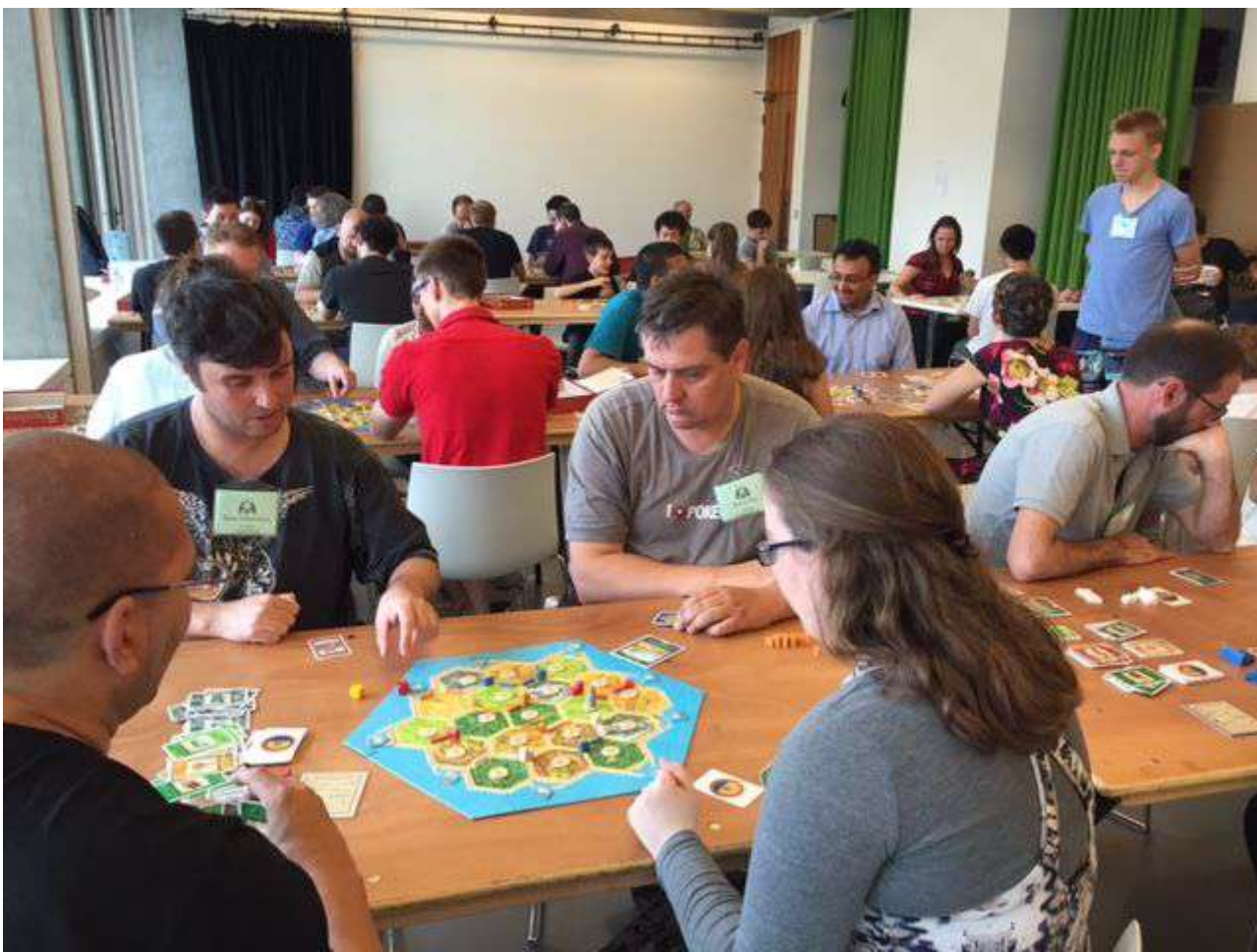
A tournament in progress.