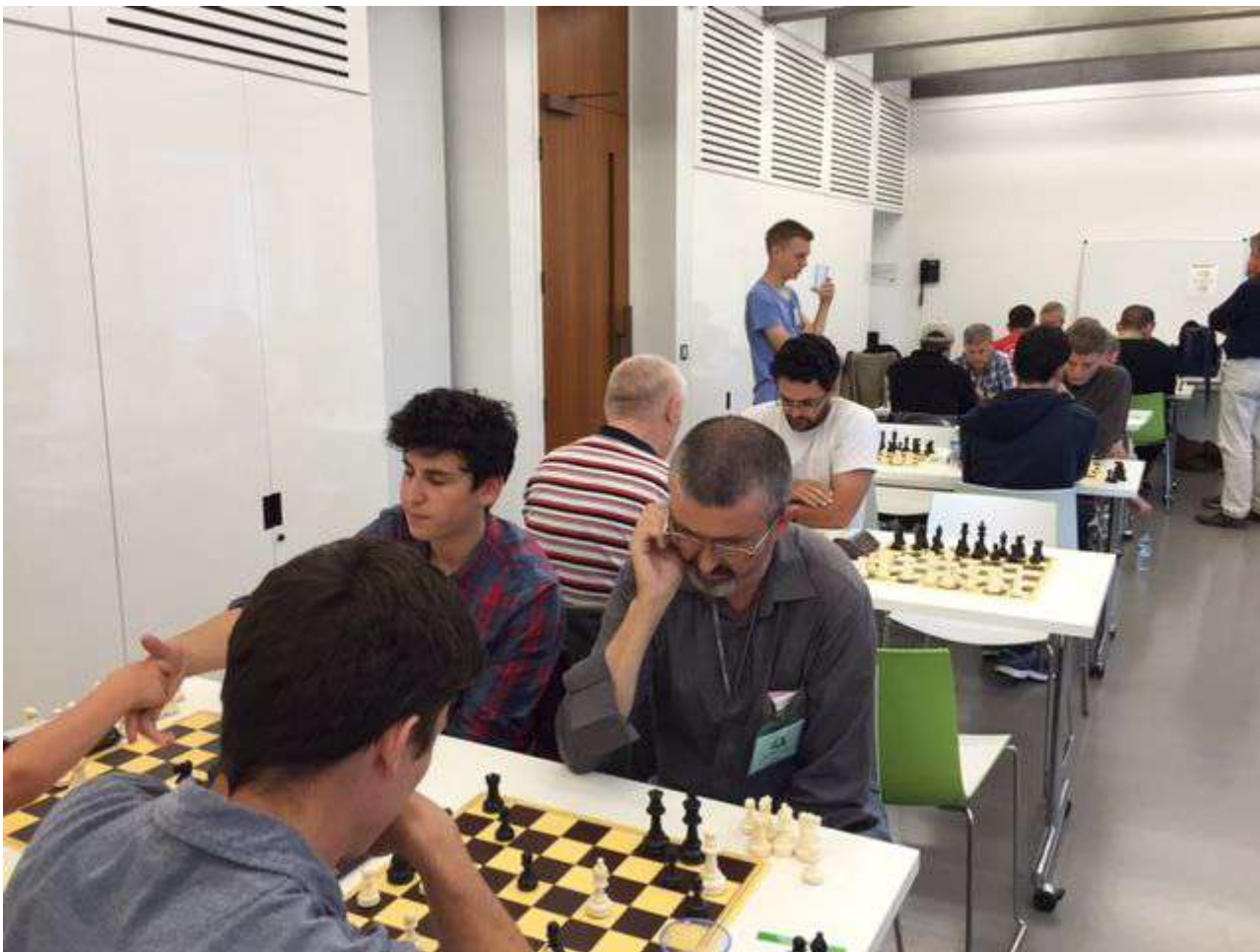
One of the chess tournaments.