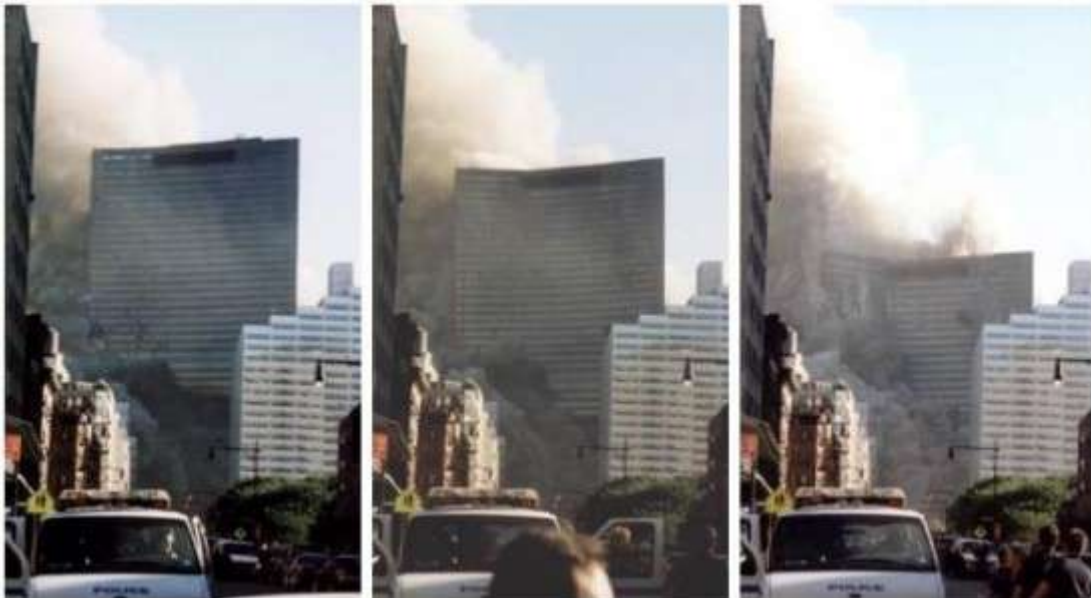
Collapse of the Building 7

Building 7 did not collapse at free fall speed into its own footprint, not quite, as is made clear in the Current video.