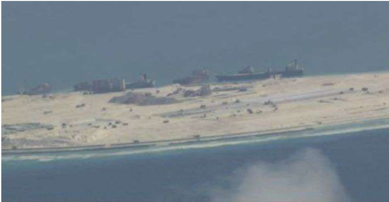
The Chinese military at work on Mischief Reef

So why is China building these artificial islands, and what is the problem? There are issues here related to international law, but the main one is that China with its close to 1.4 billion population is seeking to dominate the region militarily. The big question for us is not what should we do to stop it, but why should we care?