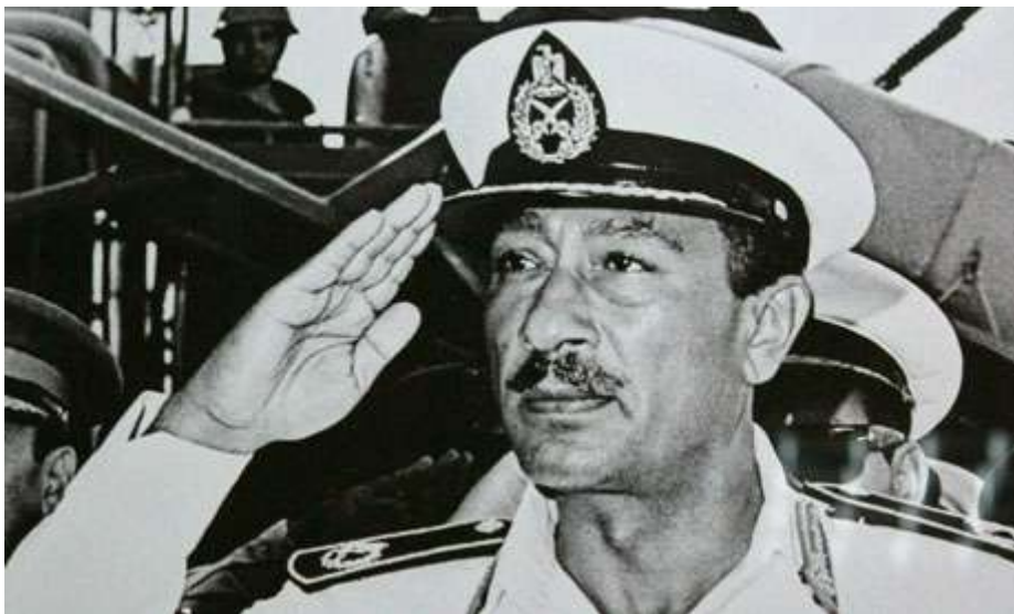
Anwar el Sadat

The greatest scientist of his own or indeed any age was born at Grantham on Christmas Day, 1642. The achievements of Sir Isaac Newton are unparalleled. He formulated the laws of motion and the law of gravitation. He is said famously to have arrived at this latter after an apple hit him on the head while he was sitting in an orchard. Newton also dabbled in optics and made the first practical reflecting telescope. He died at the fairly advanced age of 84, sadly without issue.