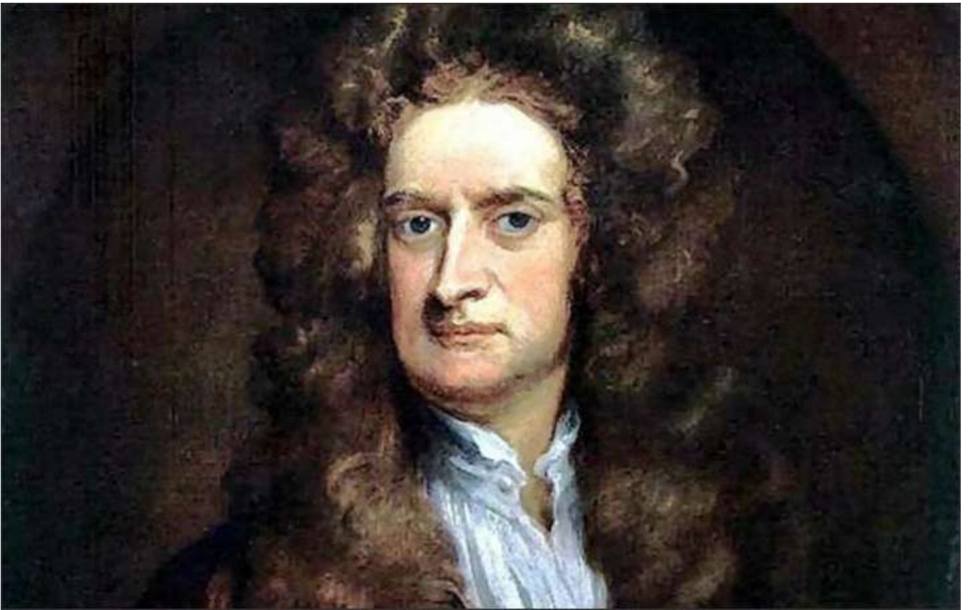
Sir Isaac Newton

The greatest scientist of his own or indeed any age was born at Grantham on Christmas Day, 1642. The achievements of Sir Isaac Newton are unparalleled. He formulated the laws of motion and the law of gravitation. He is said famously to have arrived at this latter after an apple hit him on the head while he was sitting in an orchard. Newton also dabbled in optics and made the first practical reflecting telescope. He died at the fairly advanced age of 84, sadly without issue.