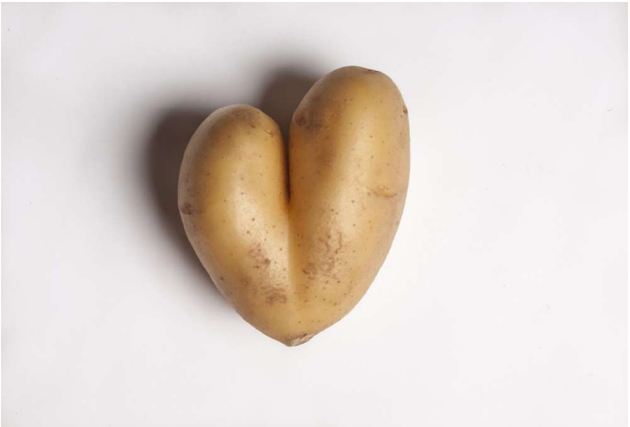
I luv potatoes

Supermarkets have massive buying power, and have long insisted that farmers produce vegetables of a certain shape and size; at one time so did the EU. Now, due to the amount of food wasted, the big players are beginning to rethink, especially the ASDA supermarket chain.