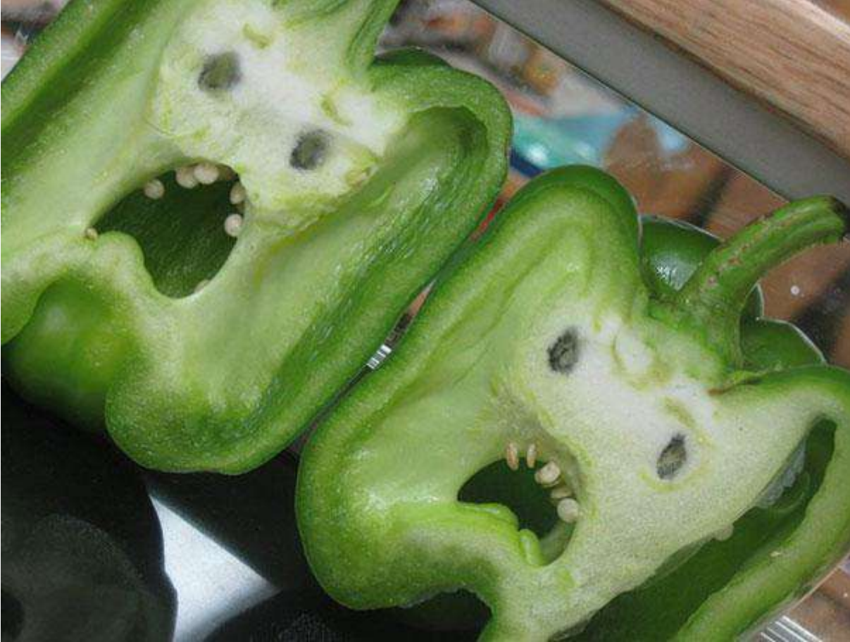
Green devils, two of them