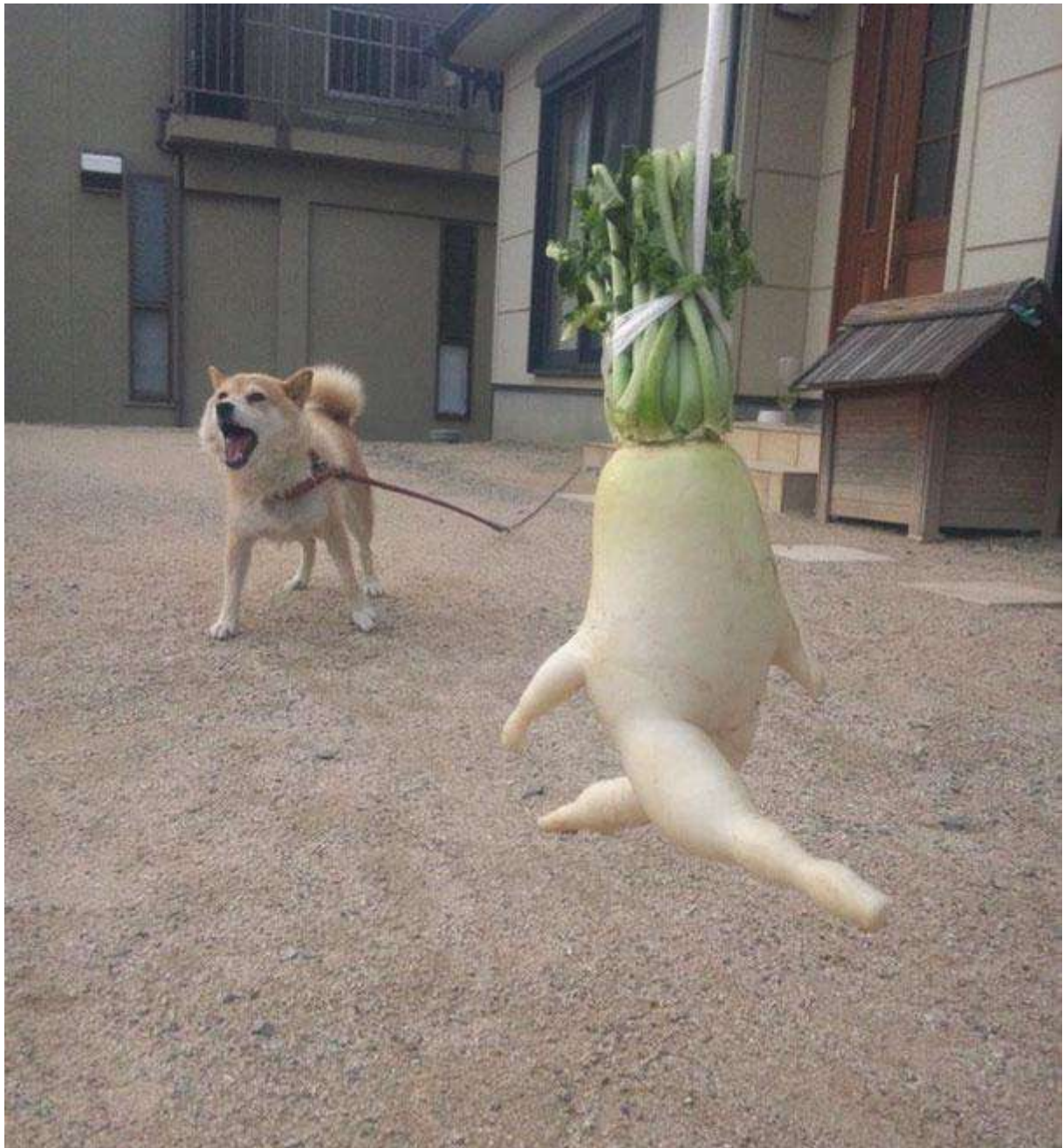
Man that is a strange one

Some people might suggest frozen food is best; the problem of wonky carrots soon disappears when they are mashed up with swede, as currently on offer in Iceland . Whatever, here are a few novelties. Would you buy these, more to the point, would you eat them?