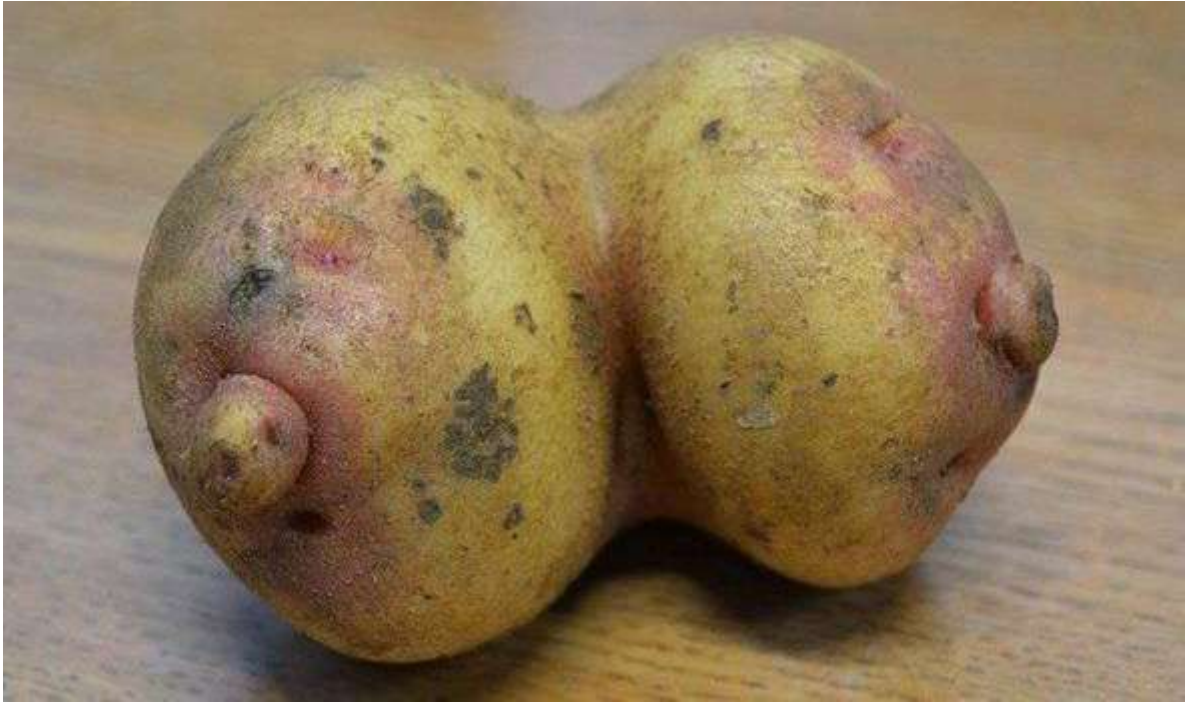
The breast kind of vegetable