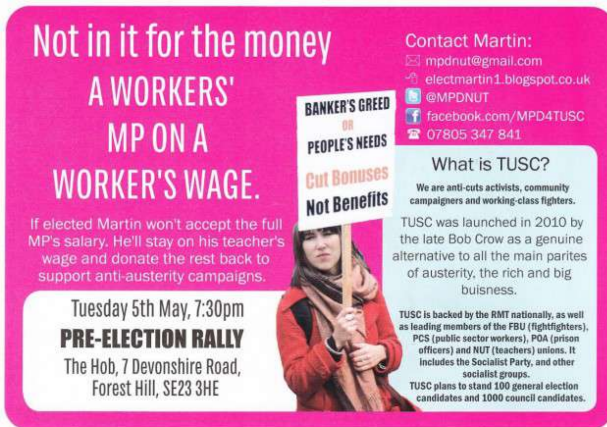
TUSC campaign flyer

officials, if MPs are well rewarded they are less likely to take “backhanders” from vested interests. Yes, financial corruption still exists, but honest incentives do tend to work.