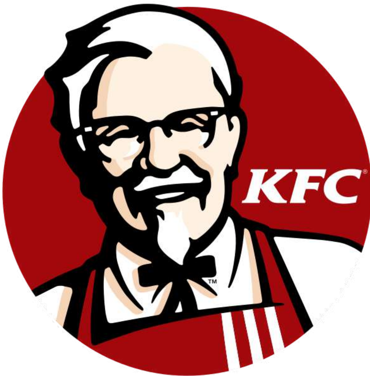
Franchise KFC under attack from the Guardian