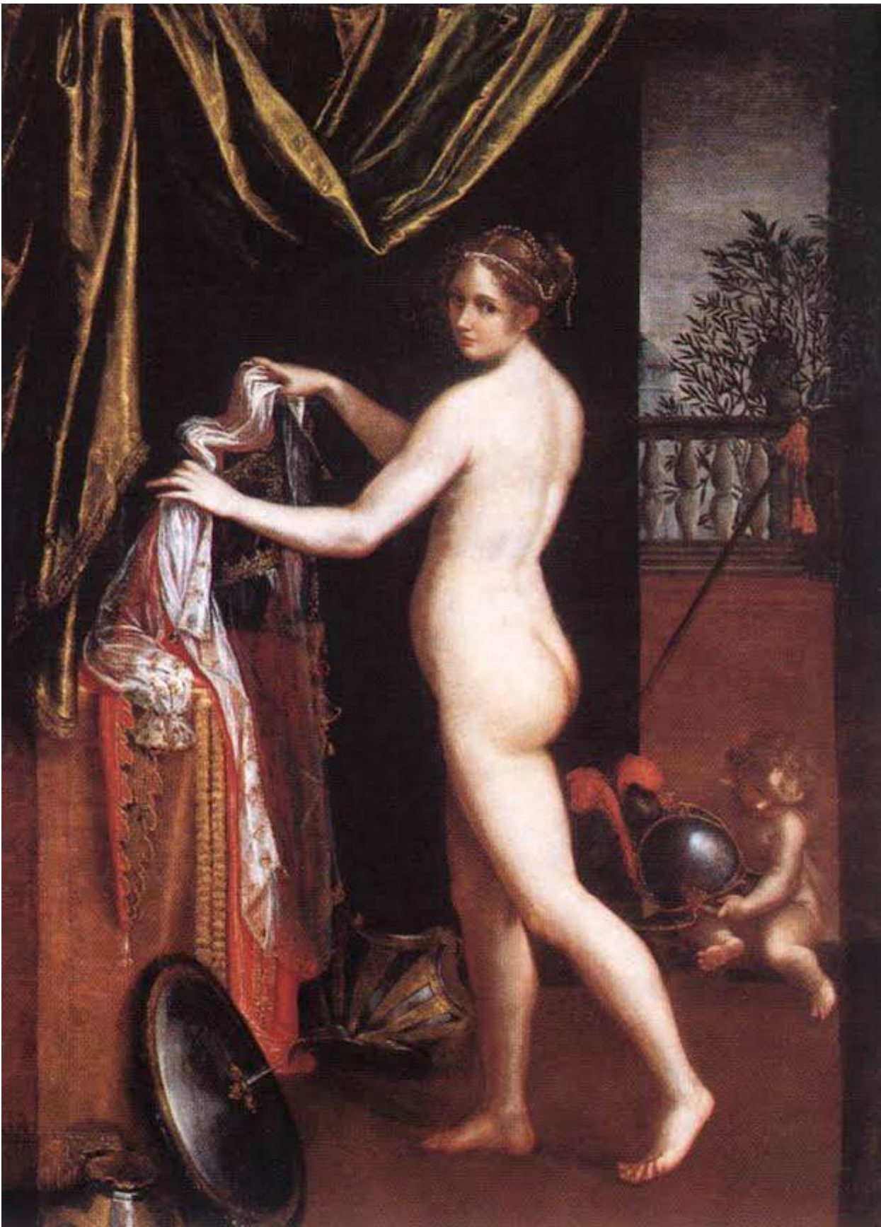
Artist: Lavinia Fontana, completion date: 1613, title: Minerva Dressing

The painting above is called Minerva Dressing ; it dates from 1613. Would anyone who knows about Renaissance art call it pornographic? Hopefully not, in any case it was painted by Lavinia Fontana, who was not simply a leading woman artist but a leading artist of her day, period. Artists have portrayed the human body naked since time immemorial yet it was not until the idiocy of women's liberation – the second wave of feminism – that mindless fanatics with vaginas decided taking off their clothes oppressed women. Pornography – so-called – was seen as a multimillion dollar industry run by men for men with women paying the price. Whether or not that was ever the case, women are now making big bucks for taking off their clothes and doing all sorts of other things on-line from the tasteful and quaint to the bizarre and disgusting. Many of them run their own websites, and if men are involved at all it is behind the camera or writing code. As far as page 3 of the Sun is comparable with the on-line industry it is a very modest contribution of a tasteful nature, and one not worth wasting ink protesting against, but some people are never truly happy unless they are angry, or in Lucy-Ann Holmes' case, outraged.