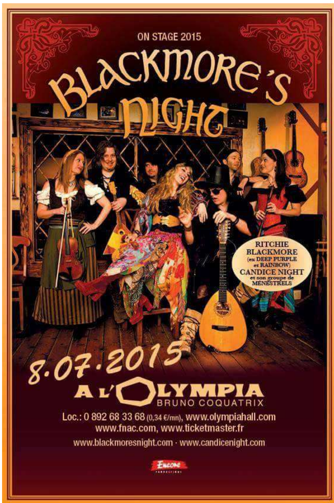
A Blackmore's Night poster advertising the current tour.