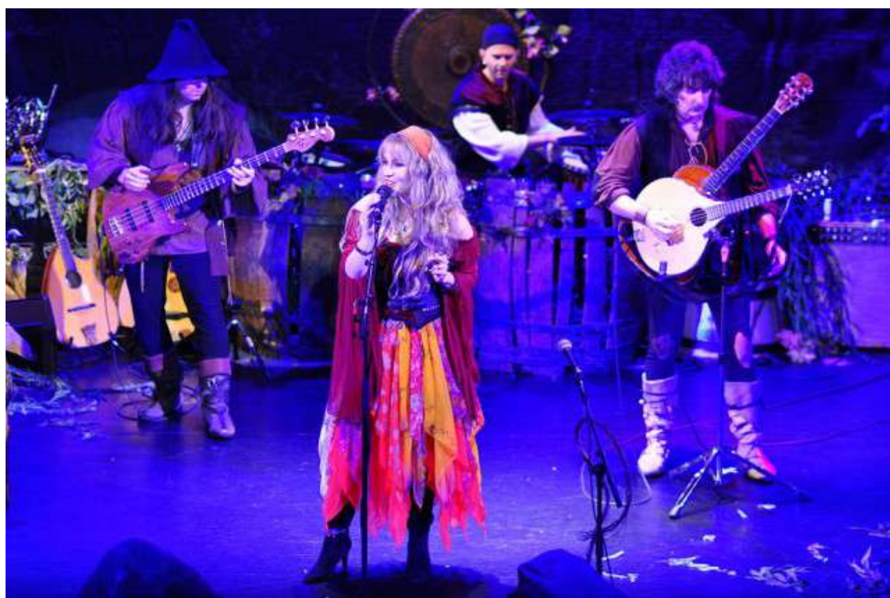
Ritchie Blackmore can be seen playing acoustic guitar behind and to her left. 2009

In 2006, Blackmore's Night recorded a song called Faerie Queen , which is what she truly is. Like her husband, she says she would rather live in the Mediaeval world than the modern one, but only with central heating and all mod cons, something many people forget about when they dream of a mythical golden age in the distant past. Her compromise is to live in a castle, and she really does dress like that much of the time. When most men fantasise about women, they mentally undress them, but a girl who has this much class looks great however she dresses.