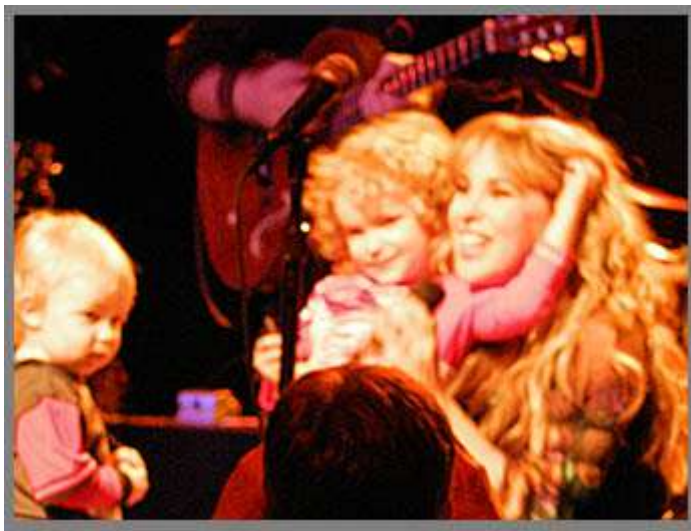
The Faerie Queen is now a proud mother of two: daughter Autumn Esmeralda was born in 2010 and son Rory Dartanyan in 2012

The following subjective list makes up the top ten tracks from Candice Night: