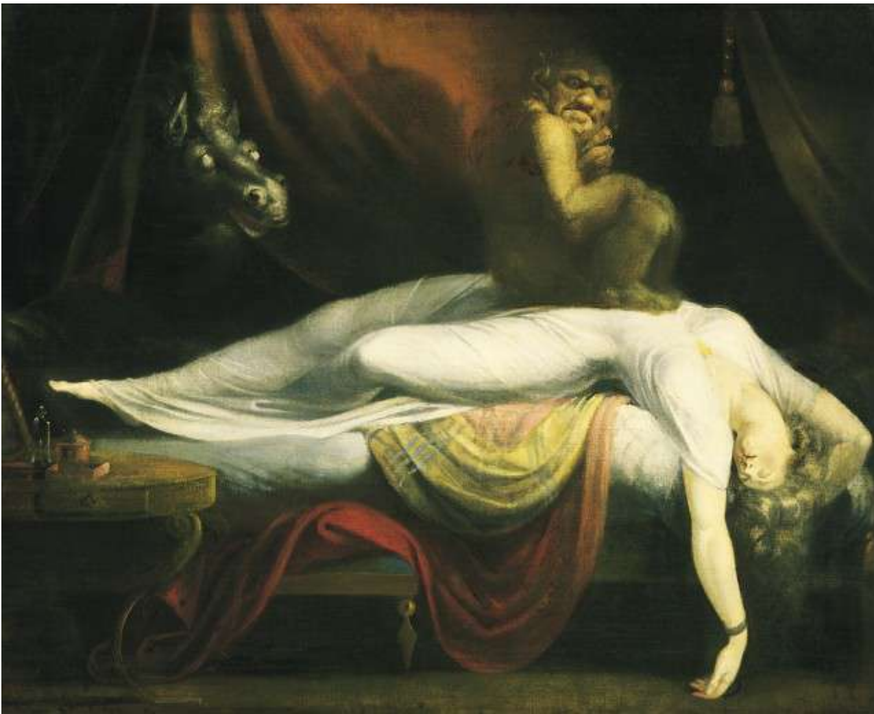
A classic depiction of Old Hag Syndrome from 1781