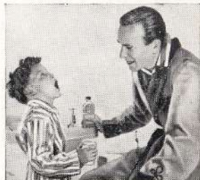
Father brought a GOLD into the house

But he tackled it at once, and soon stopped it developing, with the T.C.P. 'Two-Way' Treatment—first a gargle, then small internal doses of T.C.P. in water. Young John began to snuffle, so he had the treatment, too. John liked gargling—and he had his internal dose on a lump of sugar!