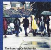
The London Cellophonic