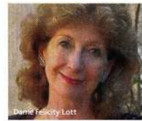
Dame Felicity Lott