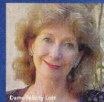
Dame Felicity Lott