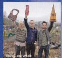
Three Cane Whale

'The series is a jewel in St Christopher's crown!'