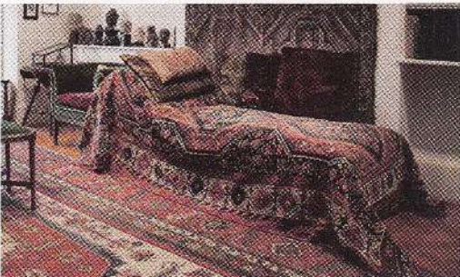
Sigmund Freud's psychoanalytic couch