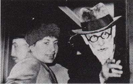
Sigmund and Anna Freud on a train, journey to England 1938