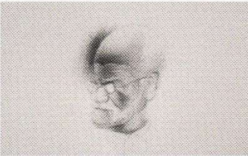
Salvador Dalí, Portrait of Sigmund Freud, 1938

This show marks the 80th anniversary of the Freud family's flight from Nazi-occupied Vienna and resettlement in London. Features original material, some never previously on display, and is paralleled with the stories of refugees today.